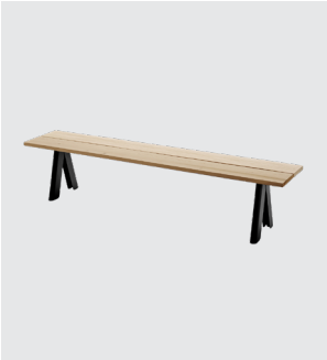
ANTHRACITE BLACK 1392013