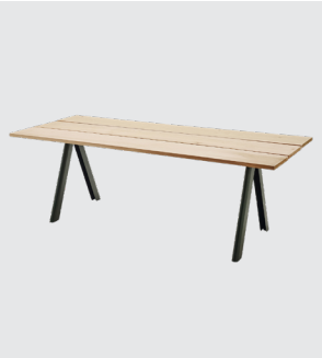
HUNTER GREEN 1392002