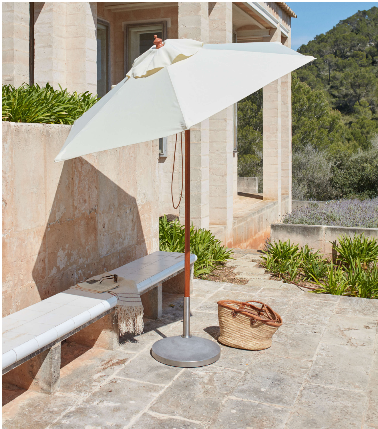
CAPRI PRODUCT FACT SHEET